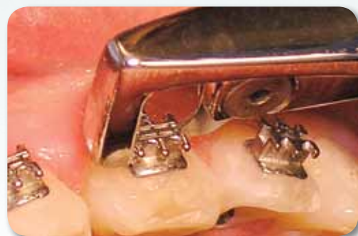
Converting SWLF Synergy R bracket to Synergy style bracket with cap conversion pliers.